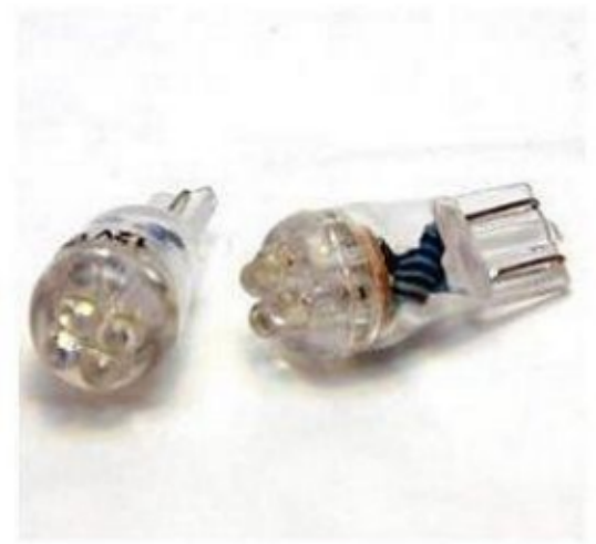
License Plate Light

If not replaced, you will fail the vehicle inspection and could receive a ticket for improper equipment.