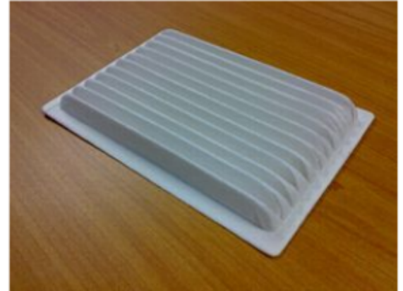
Cabin Air Filter

If not replaced, the air conditioning system will develop an odd odor. The air conditioning filter, also known as the cabin filter, removes dust and pollen from entering the car cabin.