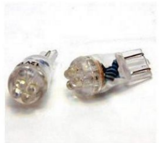
License Plate Light

If not replaced, you will fail the vehicle inspection and could receive a ticket for improper equipment.