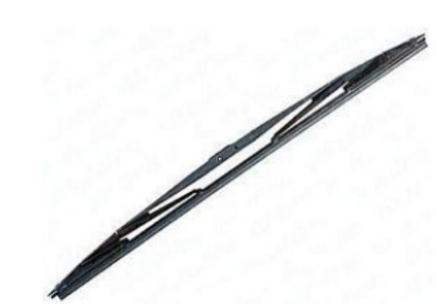
Windshield Wiper Blade

If not replaced, worn out wiper blades can cause restricted visibility and permanent damage to the windshield.