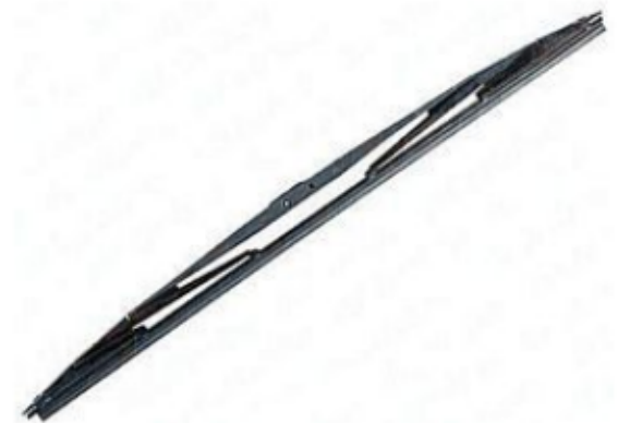
Windshield Wiper Blade

If not replaced, worn out wiper blades can cause restricted visibility and permanent damage to the windshield.